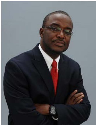
George Kronnisanyon Werner Minister of Education, Republic of Liberia